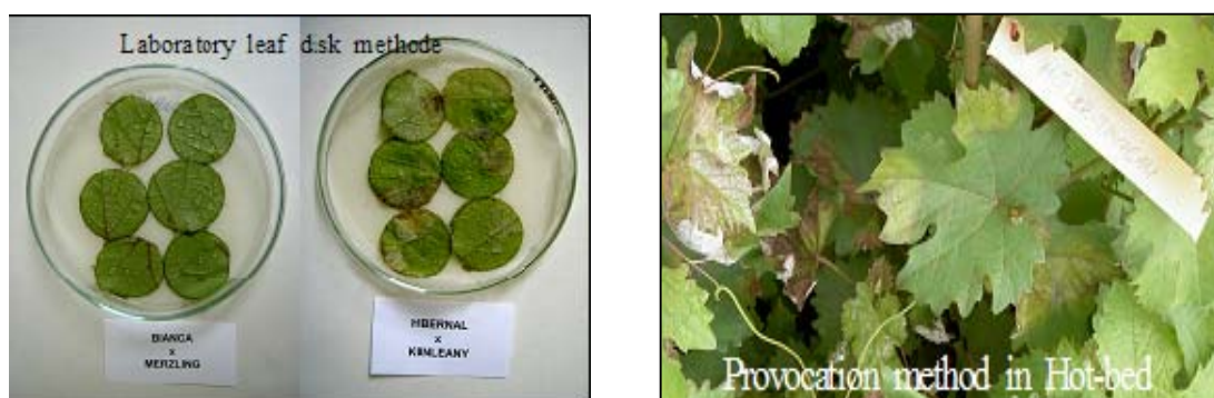
Figures 2 (left). Comparison of two different progenies by the leaf disk method

Seedlings were tested by three methods: the leaf disk method technique (Figure 2), classical provocation method in hotbed (Figure 3), and field screening.